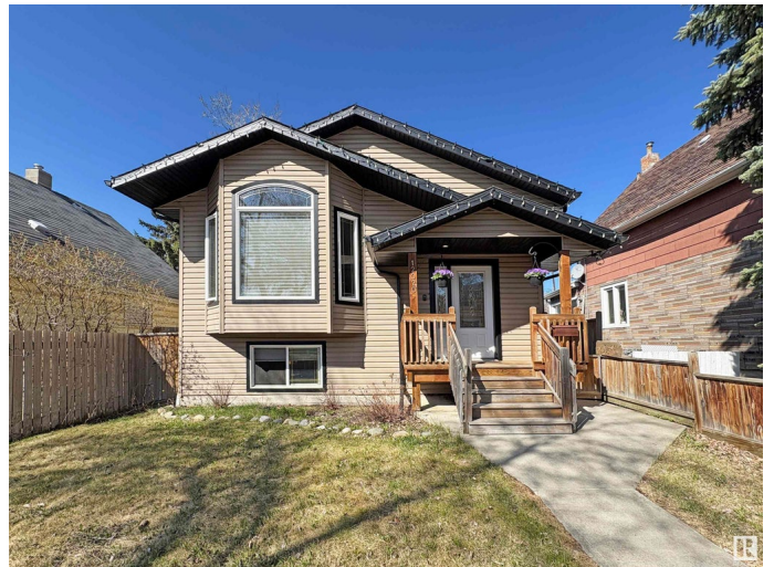
12020 95a St NW, Edmonton, AB