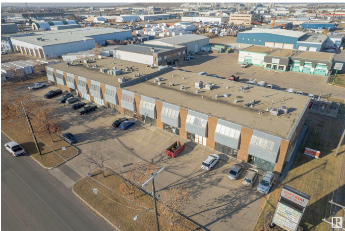
15612 116 Ave NW, Edmonton, AB

Main Floor Exterior Area 1885.08 sq ft Interior Area 1569.02 sq ft